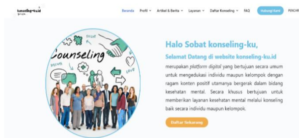
Fig. 1 results of website development https://konseling-ku.id/

The advantages of the website https://konseling-ku.id/ including the provision of counseling services,