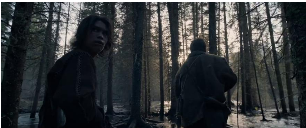
Figure III.7 Hugh Glass and group go hunting

Raid tactics is one of good strategy for group, the people involved can hunt for survive with this strategy. Working together is the key to this strategy, to get food or hunting results. Raid tactics is one the strategy when you going for hunting, with raid tactics Hugh Glass can will get animals that can be consumed for the group. Only selected people have hunting skills and have the composure in themselves, and that the raid tactics can go according to plan.