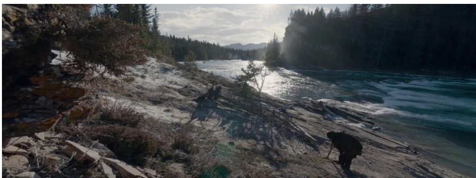
Figure III.2 Glass looks for food in the river

Sea survival is a situation that is almost easy to do, a lot of water and sea animals that can be hunted for food. Swimming skills are also needed to reach the goal of survival. Not only sea, river lakes with fast flow also require skills to survive. Sea survival is survival in dangerous water areas. Sea survival is survival in water areas, and rivers are water areas making rivers included in sea survival. In rivers and in the sea there are lots of fish and other living things that can be consumed, and the body really needs water for energy. Tools for fishing and water are needed to survive in places that are farther away