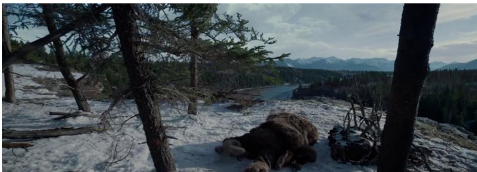
Figure III.9 Hugh Glass crawling to find the river

This scene when Hugh Glass moves to the river by crawling, when he was badly injured.