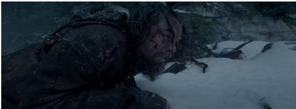
Figure III.8 search for food

Power is the ability of a person's muscles to overcome load resistance with maximum strength and speed in one complete motion. Power that can be used in survival activities and is a key strategy for survival. Strong power is needed by the hunter group to continue the route to reach the campsite of the hide sellers. One of the draining strategies in the physical body of humans, which can be used in survival, because they will face something unknown and dangerous in the forest path.