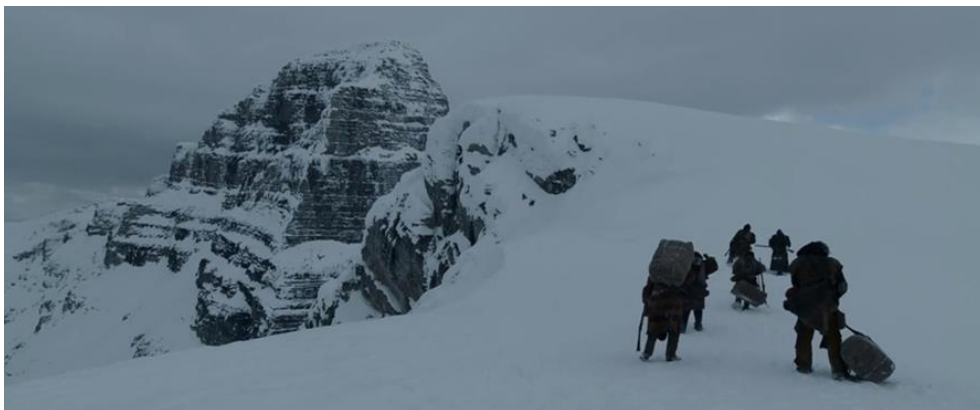
Figure III.4 Antarctic Survival

Antarctic Survival is an unfavorable condition where you have to deal with cold weather on snowy terrain, and people have to deal with the possibility of hypothermia and frostbite. In this situation the crowd cannot hunt for food, because the animals with large portions for the large group are in hibernation. Cold weather and hypothermia that hit the group that left Hugh Glass forced them to survive longer in cold weather. Hugh Glass is a navigator in the group who knows the entire area of trade and hunting routes. Low average temperatures and strong winds are difficulties in this survival field.