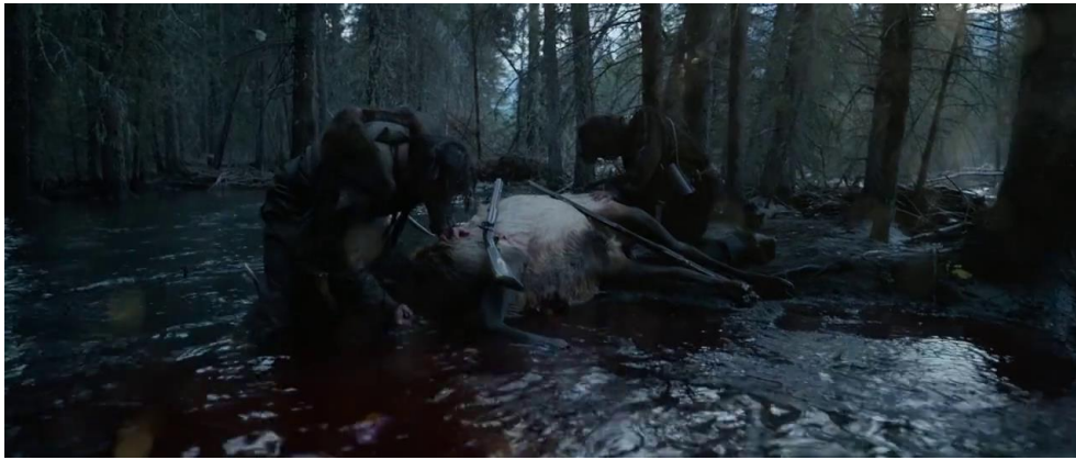
Figure III.1 Jungle survival described of Hugh Glass have hunting results

It can be seen that Hugh Glass and Hawk for to survive in the jungle they carry complete hunting equipment and quite a lot. Have equipment that has been prepared before starting the hunt. In this field it is easy to find food because there are many animals that can be hunted for consumption.