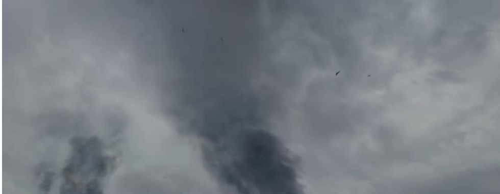
Figure III.3 the group in desert

Desert survival is a person to survive in uncertain conditions such as dessert; dehydration is the biggest threat when surviving in the desert. And people in this situation must brought the water, Hot weather and difficult water sources will make the people involved in this area victim. While in the desert they struggle to survive by looking for desert animals that can be consumed. Water that has been prepared before passing through the desert is used for their energy. The scorching heat of the sun and thirst are the main enemies of this terrain.