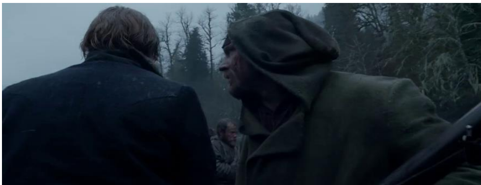
Figure III.6 Fitzgerald asks the captain, as how to survive

Planning is thinking process to decide what activity needed to achieve the main purposes and the first priority act to do. It includes inventing and preserving the plan, as psychological aspect which implement the conceptual skills. The first plan was when Hugh Glass and the group survived the impending cold in the forest and survive the Ree tribe attack. The group discuss and ask their captain, as to how they survive.